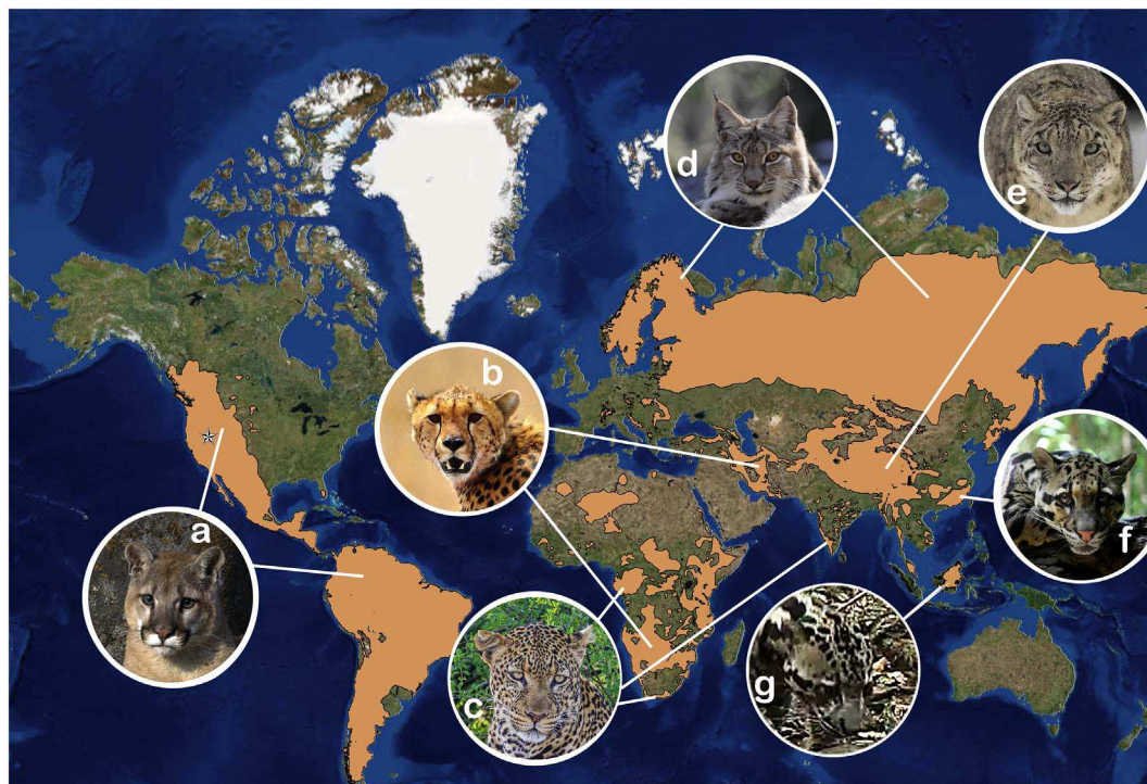
Fig. 2. The combined global distribution of seven functionally-similar subordinate, apex felids that hunt prey larger than themselves. a: puma ( Puma concolor), b: cheetah ( Acinonyx jubatus), c: leopard ( Panthera pardus), d: Eurasian lynx ( Lynx lynx), e: snow leopard ( Panthera uncia), f: clouded leopard ( Neofelis nebulosa), g: sunda clouded leopard ( Neofelis diardi). The star denotes the location of our puma study in North America.